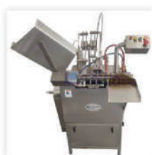
Ampoule Filling Machine