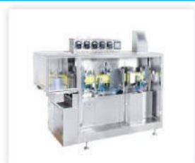
Plastic Ampoule Liquid Filling Sealing Machine