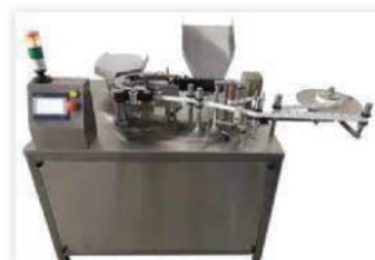
Ampoule Screen Printing